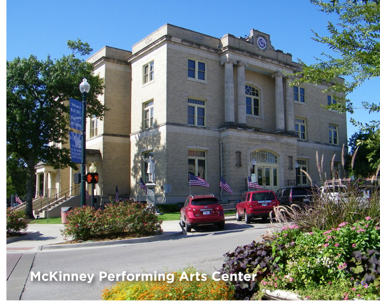
McKinney Performing Arts Center

Friday prior to Memorial Day. The largest cycling race in Texas attracting racers from across the country.