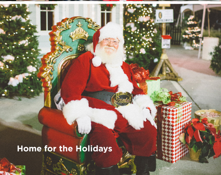
Home for the Holidays