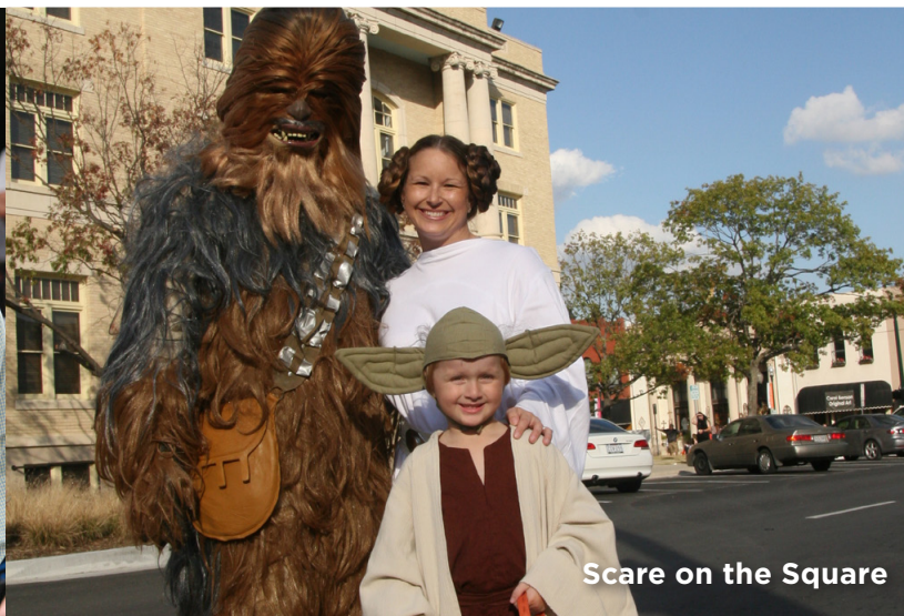
Scare on the Square