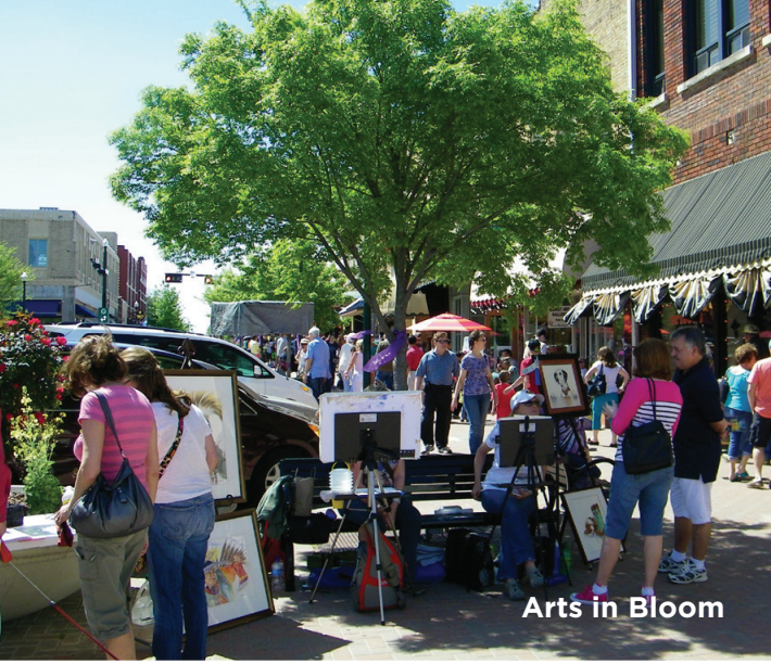
Arts in Bloom